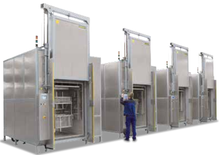
Production system, consisting of four chamber furnaces for moving the load during heat treatment along with a three-stage heat exchanger to optimize energy efficiency

The following examples outline engineering alternatives for heat recovery: