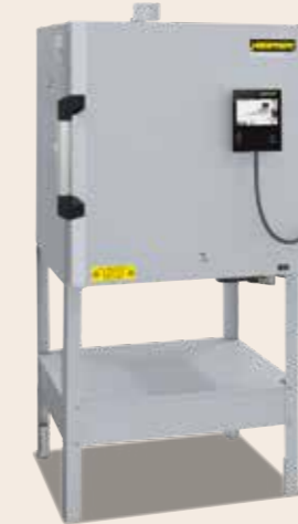
Chamber kiln N 70 E from 2021