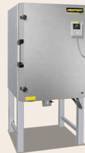
Chamber kiln N 200 from 2015