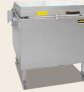
Top loader HO 100 from 2018