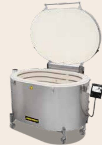
Top loader Top 220 from 2024