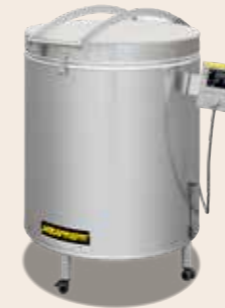
Top loader Top 100 from 2015