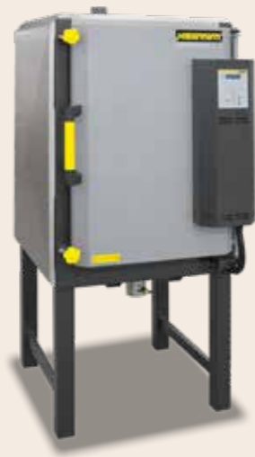
Chamber kiln N 200 from 2006