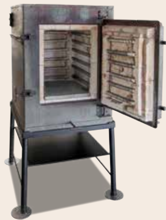
Model 14/S from 1949