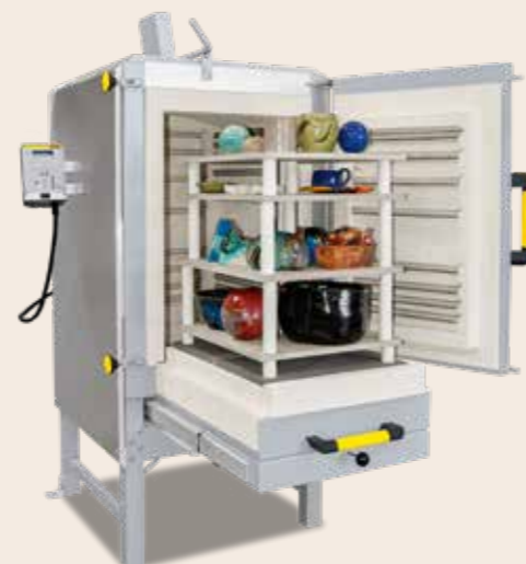
Chamber kiln NW 300 from 2012