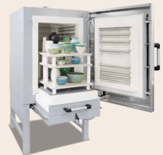
Chamber kiln NW 300 from 2024