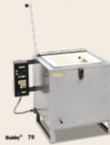
Hobby kiln Hobby 70 from 1982