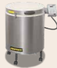
Top loader Top 60 from 2003